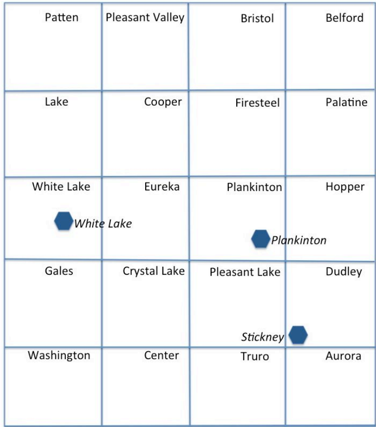
Figure 1: Civil Townships and Municipalities in Aurora County.