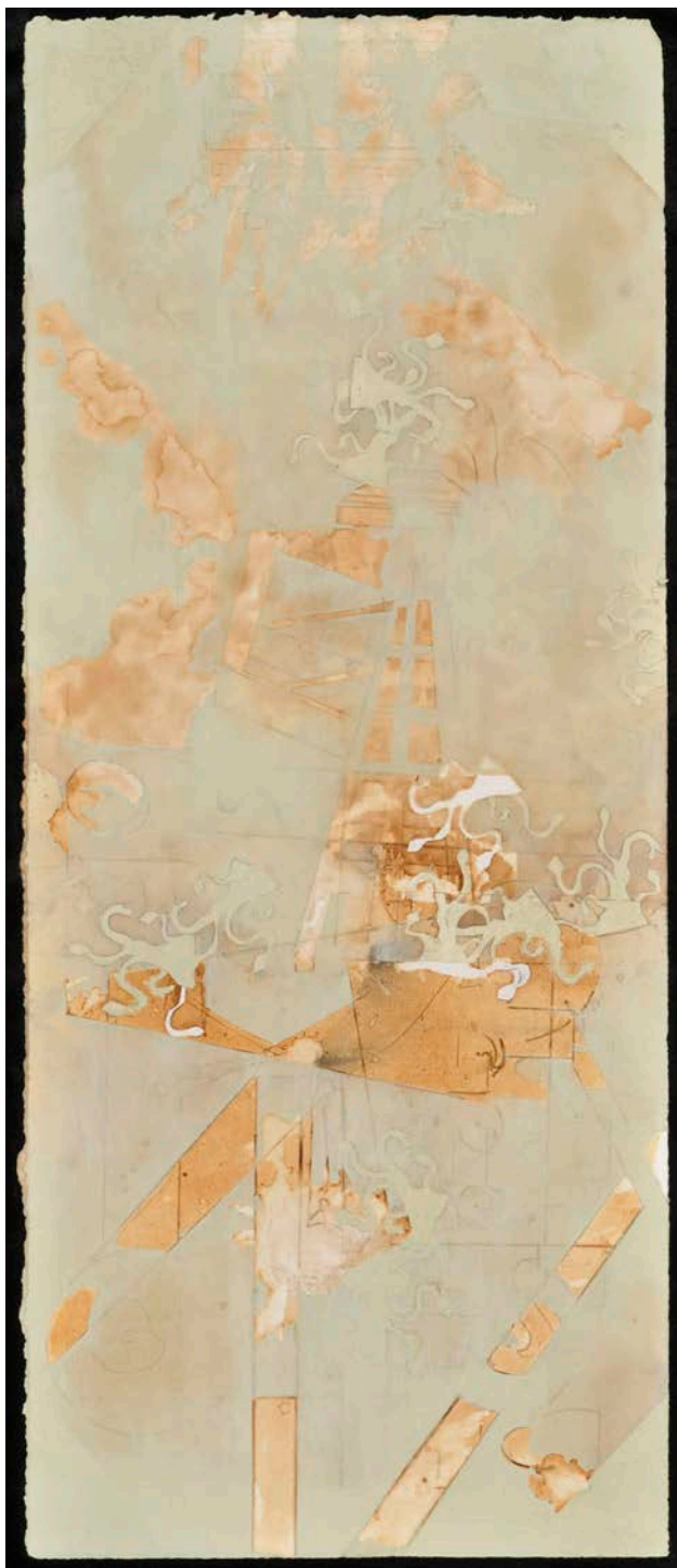
Nostalgia, Lemon juice, graphite and house paint on paper, 24" X 10", 2011