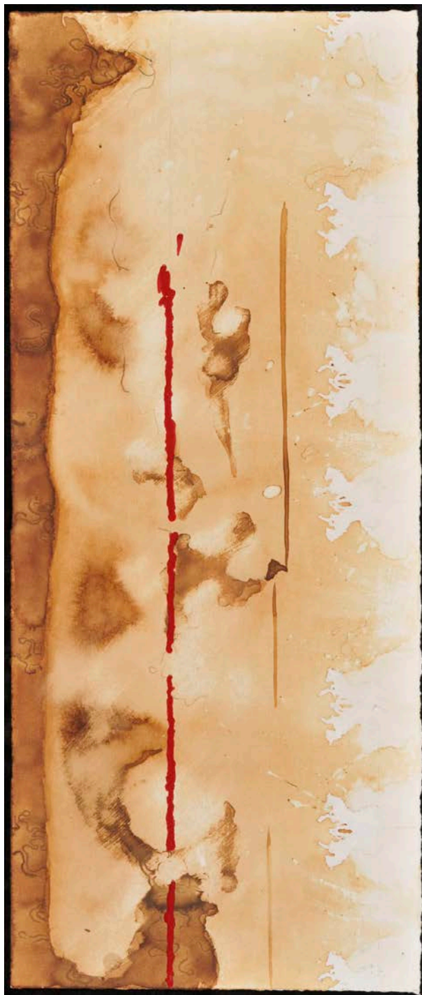
Anvil Top, Lemon juice, graphite and nail polish on paper, 24" X 10", 2011