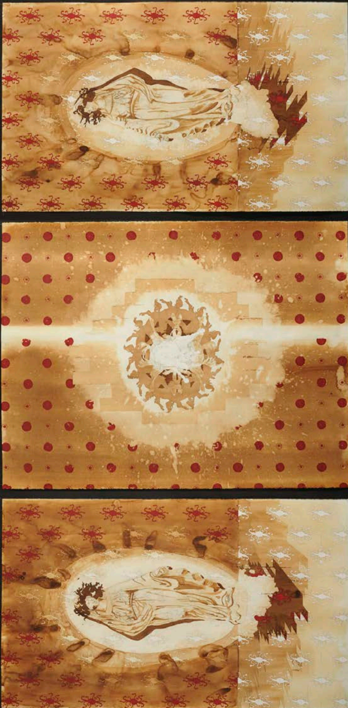
PM Nest, Lemon Juice, graphite and oil paint on paper, 100" X 50", 2010